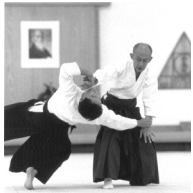
Nidai Doshu | Kisshomaru Ueshiba | 1921-1999